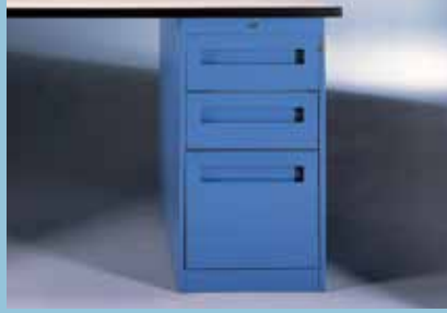
Two Box, One File Drawer Pedestal Store both, letter or legal size documentation and other small items like hand tools, valuables, personal items, etc.