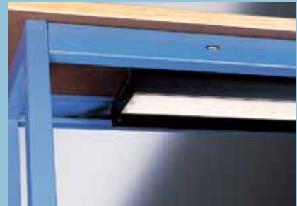
Instrument Shelf Task Light 30-watt lamp with nine-foot cord and switch, attaches under instrument shelves for added visibility.