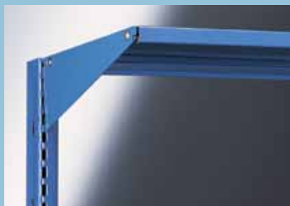
Canopy Top Shelf Provides additional storage space to unit.