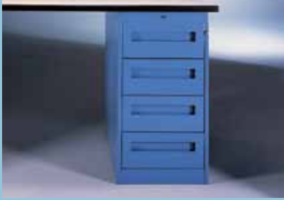
Four Box Drawer Pedestal The ideal choice for storing tools, small instruments, forms, etc. All four drawers lock or unlock all at once for convenience.