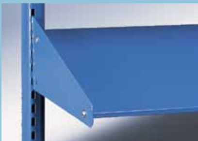
Sloped Shelf This shelf is perfect for holding documentation and literature.