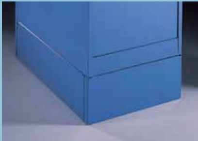
Pedestal Base Optional base raises pedestal off floor by 6".