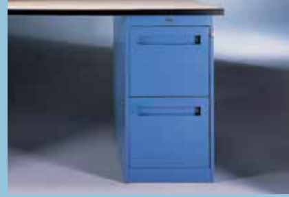
Two File Drawer Pedestal Available in two sizes, the 24" two drawer pedestal offers a total of 44 3/4" of filing space while the 28" two drawer option offers a total of 52 3/4".