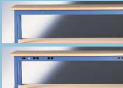
Instrument Shelf Three sizes offered, 18"H x 15"D in widths of 60", 72" & 96", and may be fitted with optional power rails and either a standard or static control top.