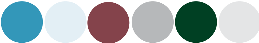
Accent Blue (10) Arctic White (61) Wine (118) Dove Grey (74) Green (21) Oyster (470)

Standard Colors are available at no additional charge. Premium and Special Matched Colors are available for an upcharge. Finishes shown above are representative of the actual finishes. Please contact your local Tennsco dealer for more precise color swatches.