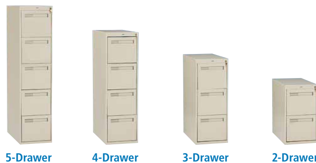
All vertical files are 28" deep and are available in 15" (letter) and 18" (legal) widths.