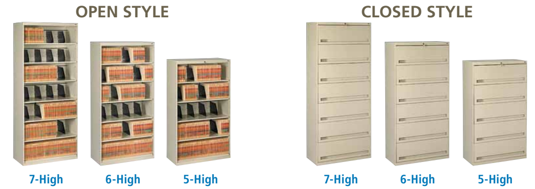
Fixed shelf files are 16 1/2" deep x 36" wide.